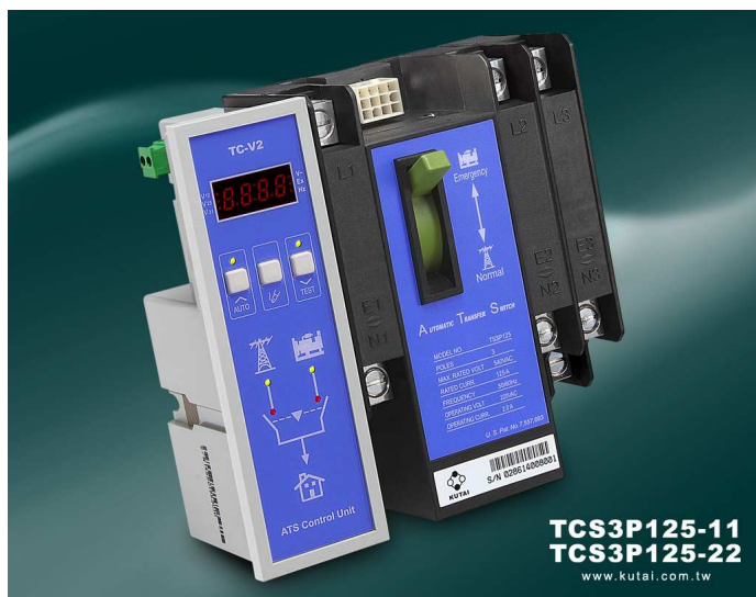
TCS3P125-11 TCS3P125-22 www.kutai.com.tw